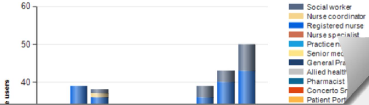
Number of active users by role by month